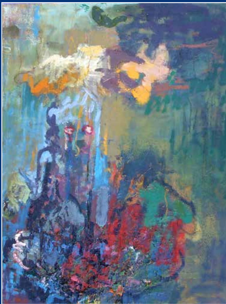
Renee Bouchard, Monk , 2011, Oil on canvas