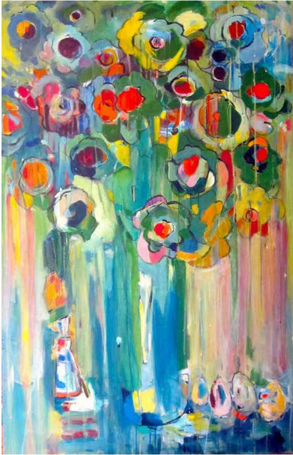
Ilene Spiewak, My Favorite Flower Acrylic and oil on canvas